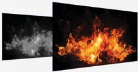
FULL ARRAY LOCAL DIMMING