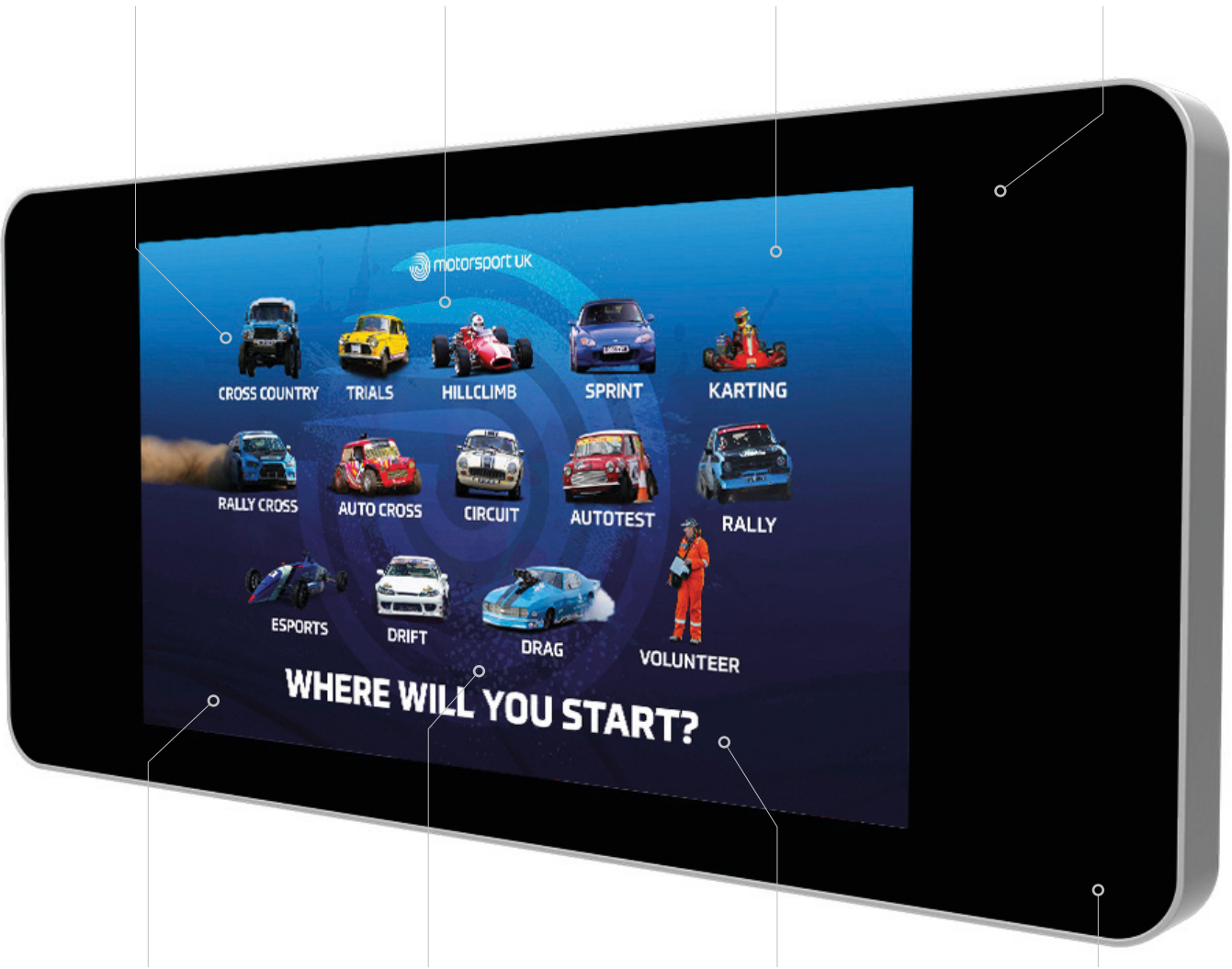
PROTECTIVE UV FILM