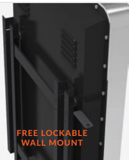
FREE LOCKABLE WALL MOUNT